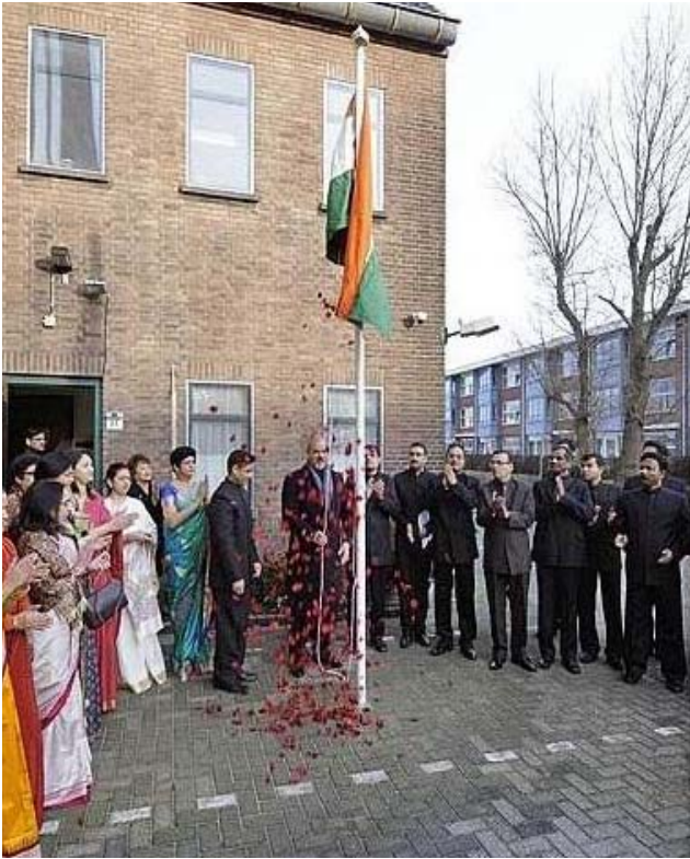
Flag hoisting at Gandhi Centre

was attended by the Indian diaspora and Surinami Hindustani Community. The event was well attended by members of Indian diaspora and the Surinami-Hindustani community. A reception for Dutch dignitaries, members of the Diplomatic Corps and the Indian diaspora and the Surinami Hindustani Community and friends of India was hosted on 27 January 2014.