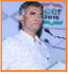
- Krishna Byre Gowda , Minister of Agriculture (Government of Karnataka)

A forum like this, connects those with technologies with the ones in need of technological solutions. It helps in raising the awareness level about the availability of technological solutions and knowledge.